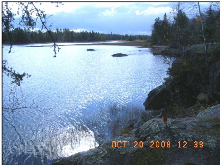
Little Gabbro Lake campsite near entry point portage

Nickel Timber Sale: This sale consists of 7 payment units within 1 mile or less of the BWCAW boundary, including Little Gabbro Lake within the wilderness. Baseline data has been collected at five sites on Little Gabbro Lake . One of these receptor sites was revisited in October and