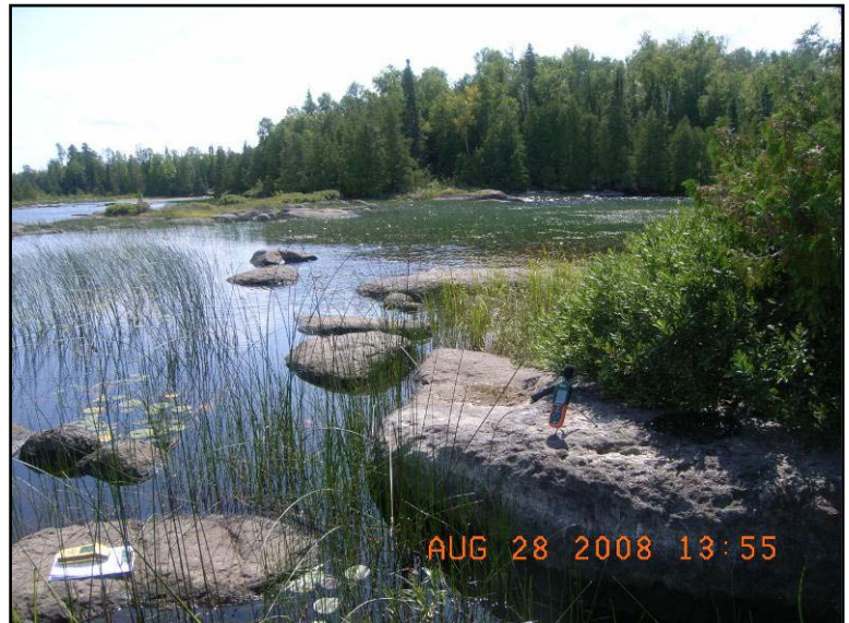
Small island near south shore of Isabella Lake

FR 382: Bog Lake /Tofte District: Sept.28. ATV not heard by observer, west wind strong, constant, gusts to 25 mph, wind through leaves constant background sound, as well as wave action against shoreline. Receptor site was 1.4 miles downwind of ATV.