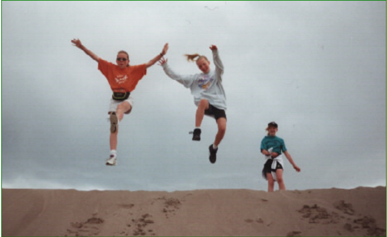
Great Sand Dunes Wilderness, Colorado

FREEDOM TO...hike...explore...run...jump...find peace...ride a horse....play...listen to birds...see wild animals...take photographs...watch the sky...hear the wind...challenge yourself...rest...learn...camp...study the stars...find wildflowers...stroll...meditate...rejuvenate...feel the weather...get lost (and find yourself)...listen to frogs...enjoy the scenery...glide in a canoe...dip in a cold stream....fish in a lake...discover mushrooms...share nature with family and friends...chase clouds...hear a tumbling waterfall....and freedom for nature to be wild!