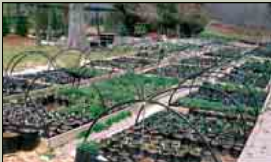
Containerized Native Plants for Rehabilitation Plantings

Using National Fire Plan funds and State and Private Forestry Forest Stewardship Funds, the Forest Service has partnered with the State of Utah, Ephraim City, Rocky Mountain Elk Foundation, and other organizations to construct a 17,100-square-foot facility that will store up to 500,000 pounds of native seed to be used for fire rehabilitation, wildlife habitat improvement, and other projects.