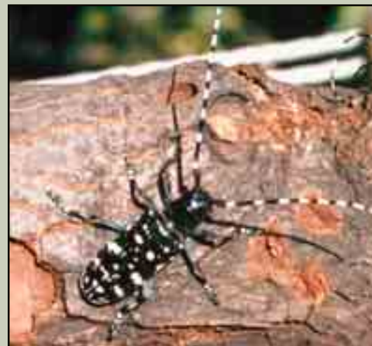
Asian Longhorned Beetle