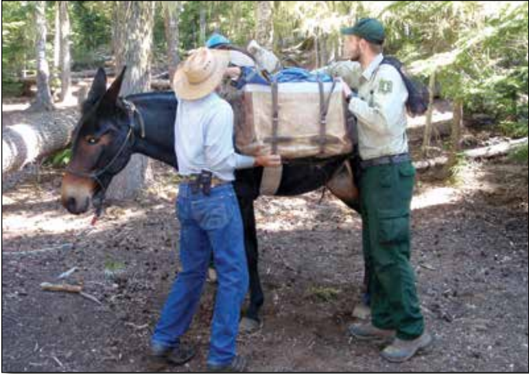
Mink Lake Basin, Three Sisters Wilderness, Willamette National Forest