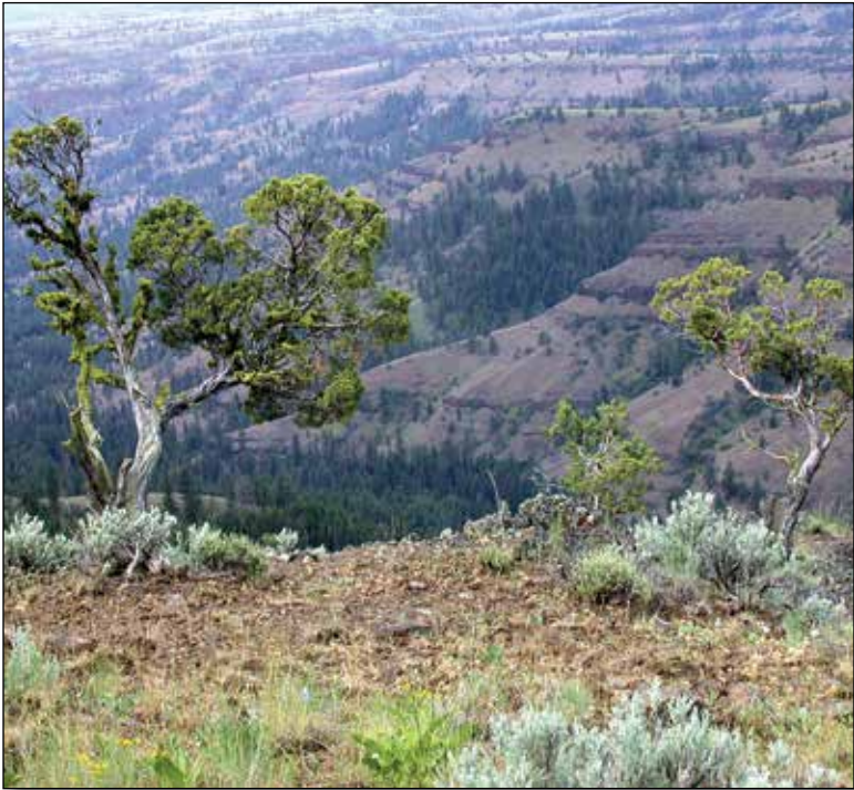
North Fork John Day Wilderness, Umatilla National Forest