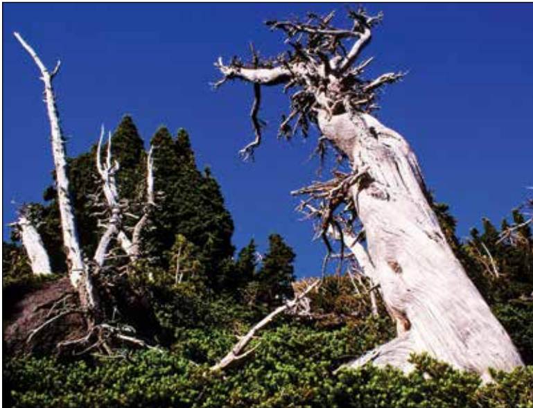
Mt. Jefferson Wilderness, Deschutes National Forest

The following sections of this guide show the threats to these four qualities and the actions that can be taken to preserve them.