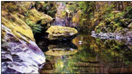
Opal Creek Wilderness, Mt. Hood National Forest