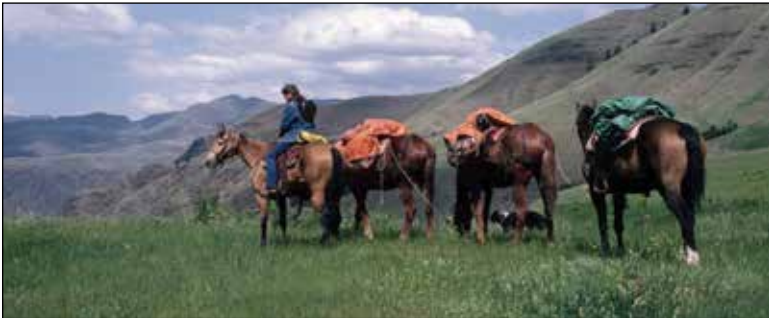
Hells Canyon Wilderness, Wallowa-Whitman National Forest