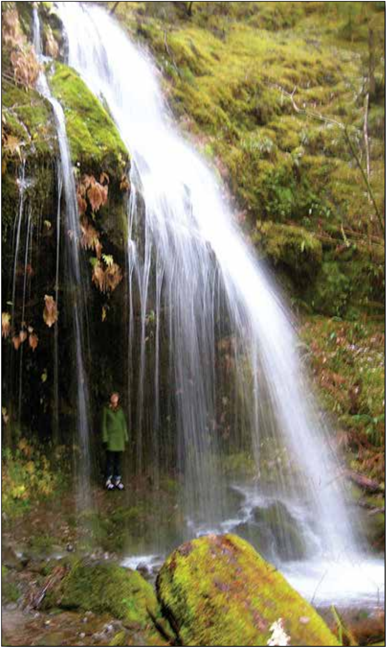
Bull of the Woods Wilderness, Mt. Hood National Forest