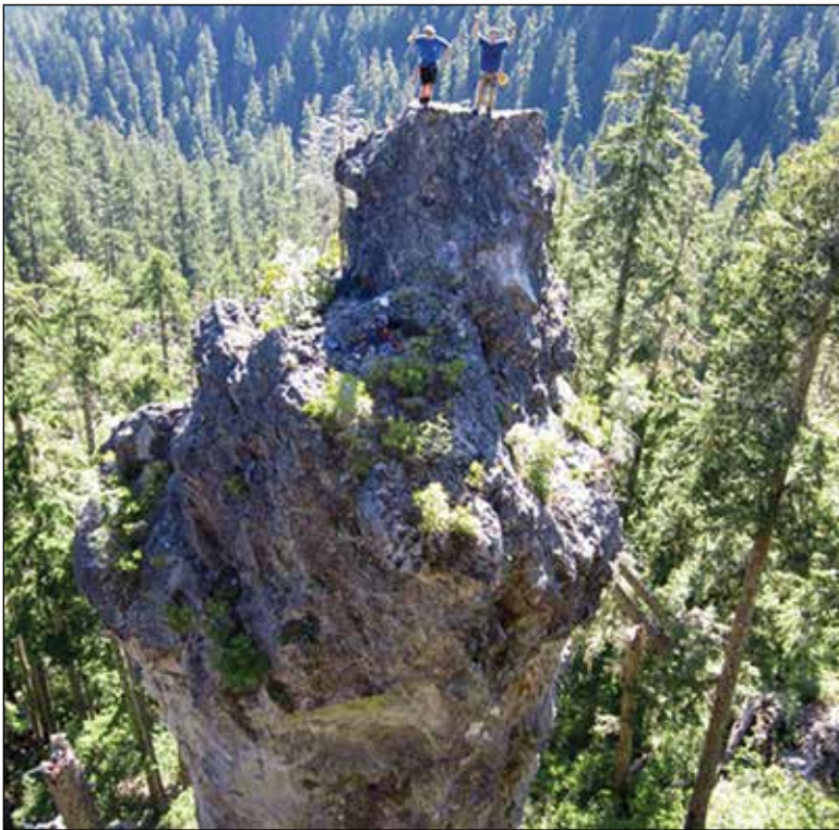
Menagerie Wilderness, Willamette National Forest

The promise of the Wilderness Act is that these lands will remain free and wild in perpetuity. However, designation alone does not ensure that Wilderness will stay wild forever. It is important for your clients to know that we all must keep the promise.