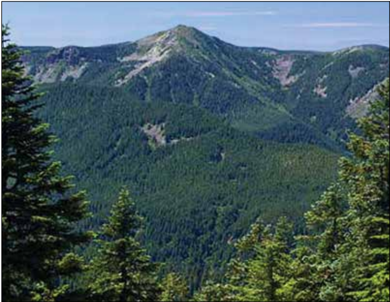
Mark O. Hatfield Wilderness, Mt. Hood National Forest