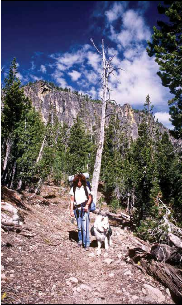
Gearhart Wilderness, Fremont-Winema National Forests