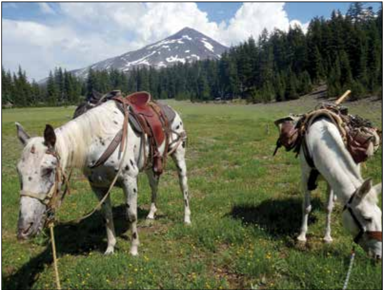
Racetrack Meadows, Three Sisters Wilderness, Willamette National Forest