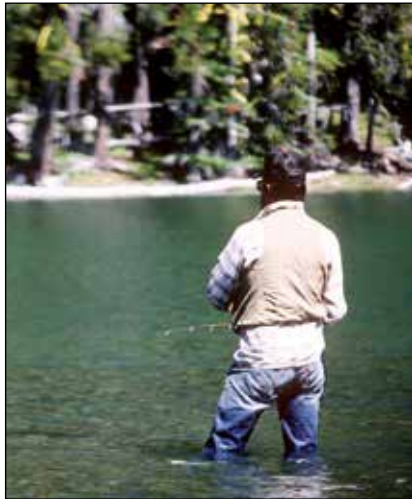
Mountain Lakes Wilderness, Fremont-Winema National Forests

Only seven percent of the land in our country is preserved as Wilderness — 2% in the continental United States. Twenty percent of this acreage is located in the PNW.