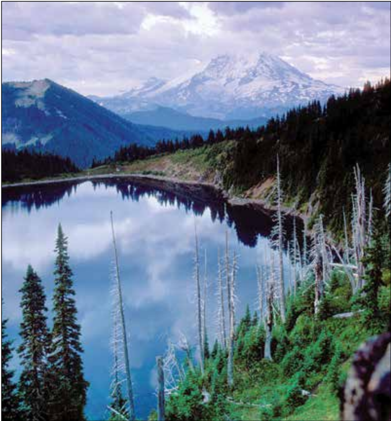
Summit Lake, Clearwater Wilderness, Mt. Baker-Snoqualmie National Forest

“If future generations are to remember us with gratitude rather than contempt, we must leave them something more than the miracles of technology. We must leave them a glimpse of the world as it was in the beginning, not just after we got through with it.”