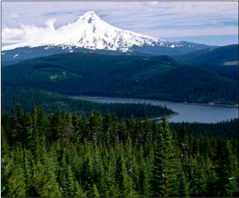
Mt. Hood Wilderness, Mt. Hood National Forest