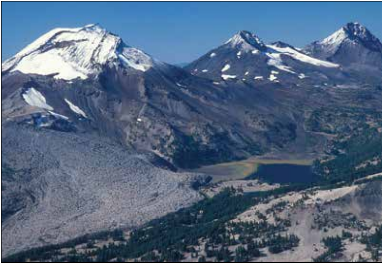
Three Sisters Wilderness, Willamette-Deschutes National Forests