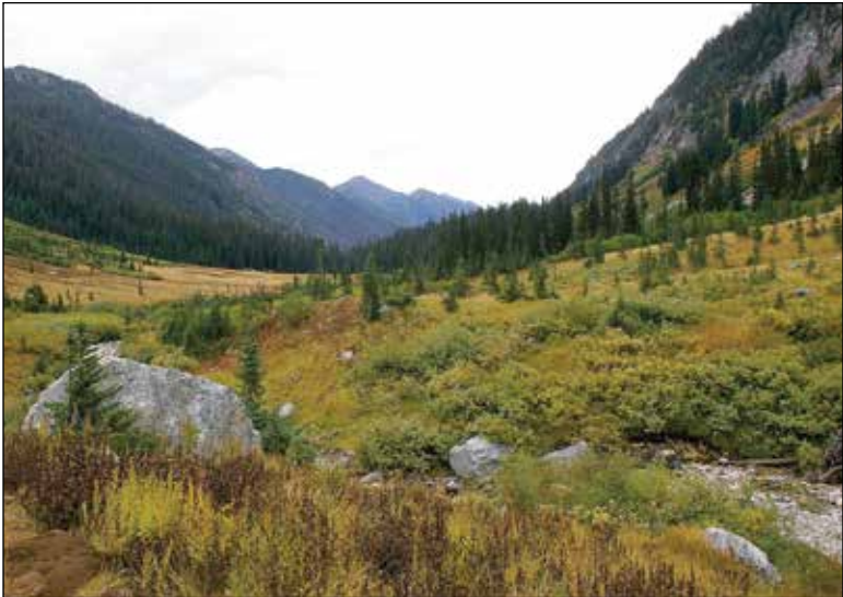
Glacier Peak Wilderness, Mt. Baker-Snoqualmie National Forest