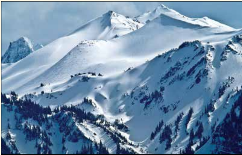
Goat Rocks Wilderness, Gifford Pinchot National Forest

Many areas have structures that existed before the area was designated as Wilderness. There are two reasons why these structures may be allowed to stay: 1) they are necessary for the administration of the area, and/or 2) they are an integral part of the history and cultural heritage of the Wilderness area. Agency professionals evaluate the need for and historic value of a structure before a management decision is made to remove or retain.