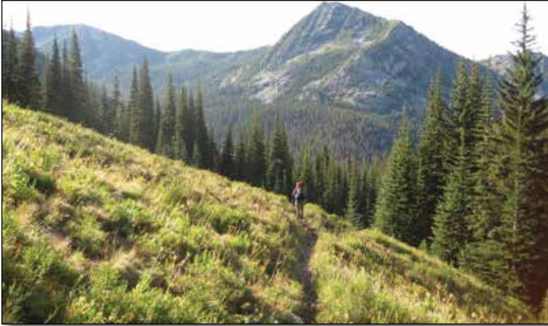
Lake Chelan-Sawtooth Wilderness, Okanogan-Wenatchee National Forest