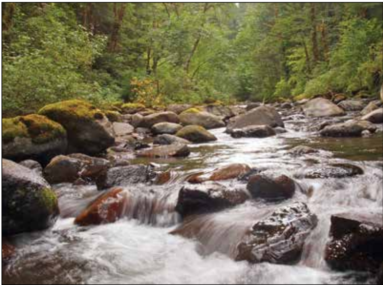
Boulder Creek Wilderness, Mt. Baker-Snoqualmie National Forest