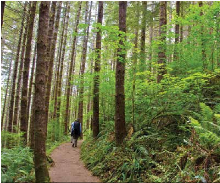
Drift Creek Wilderness, Siuslaw National Forest