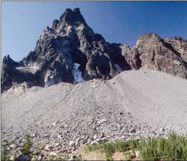
Mt. Thielsen Wilderness, Fremont-Winema National Forest