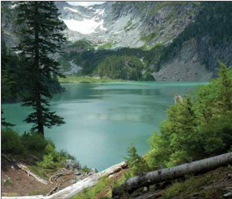
Henry M. Jackson Wilderness, Mt. Baker-Snoqualmie National Forest

Threats to fish and wildlife habitat include development on adjacent lands and disruption of ecological processes from outside threats like invasive species.