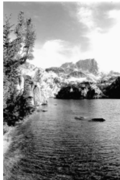
Figure 3—Crown Lake and Slide Mountain in the Hoover Wilderness; managed by the U.S. Forest Service (CA).