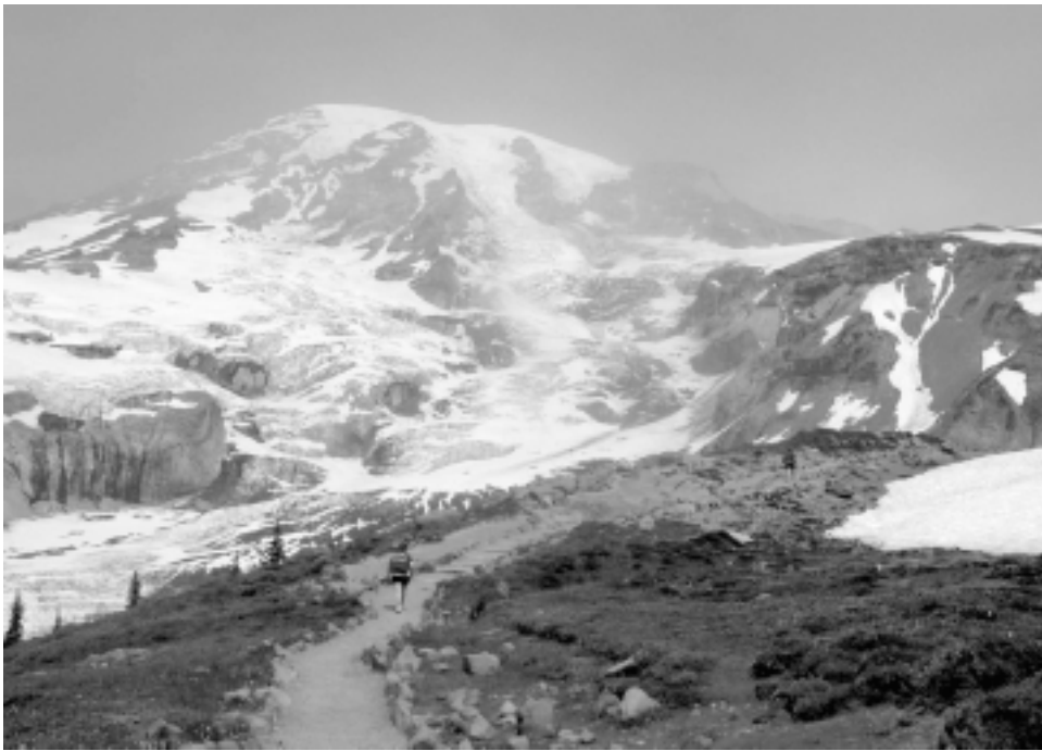
Figure 2—Hiker ascending an alpine trail in the Mount Rainier Wilderness; managed by the National Park Service (WA).

differences in personal characteristics, such as norms and expectations. One person may be so motivated by a need for some quiet time that a high degree of solitude is experienced despite crowds of people all around. Another similarly motivated person, less tolerant of crowds, may experience resentment and stress while attempting to get away from crowds to find a suitably quiet interlude. Finally, someone else out for exercise and social interaction might never slow down or experience tranquility the entire time—and yet be perfectly satisfied.