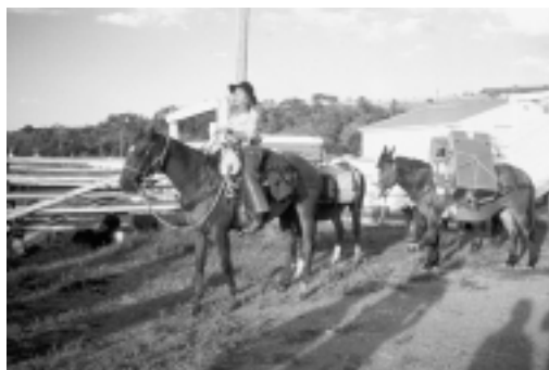
A horse-packing demonstration.

Analysis of the telephone interviews with 24 teachers six months after they attended a workshop revealed that the workshops increased teachers' knowledge of wilderness, wilderness values, appropriate behaviors, and uses. Of the teachers who have used the curriculum, 70% used it to supplement their science program. Teachers indicated that the greatest strengths of the workshops were (1) the workshop format that allowed participants to teach and actively participate in lessons from the curriculum, (2) the teaching resources made available to them, and (3) the in-depth knowledge of the instructors. Teachers also indicated it is important to offer workshops for academic credit (92%) and renewal credits (88%). Teachers want more age-appropriate lessons and more professional enhancement opportunities. They suggested that a wilderness education courseshould be made available on the Web, so teachers in remote areas can