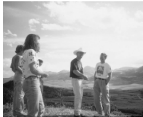
A teacher workshop field trip on the Rocky Mountain Front in Montana.

A follow-up telephone contact was initiated with 15 nonrespondents. The intention was to telephone these nonrespondents to determine why they had not responded, and if there were significant differences in responses from the 52% of teachers who had returned