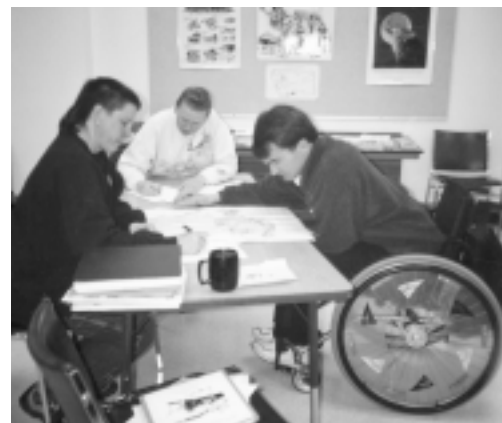
Teachers and natural resource professionals study wilderness maps.

In a third data collection method, teachers who had recently completed a workshop were interviewed by telephone. Individual telephone interviews were conducted with 24 teachers within six months of their participation in a training workshop to (1) determine if there was a relationship between workshop attendance and use of the curriculum, (2) determine if teachers were receiving adequate information on best practices for current state and national educational standards, and (3) develop guidelines for an optimal training workshop model or delivery mechanism to meet curriculum goals and objectives. Comparisons were made between information gathered from teacher surveys and interviews