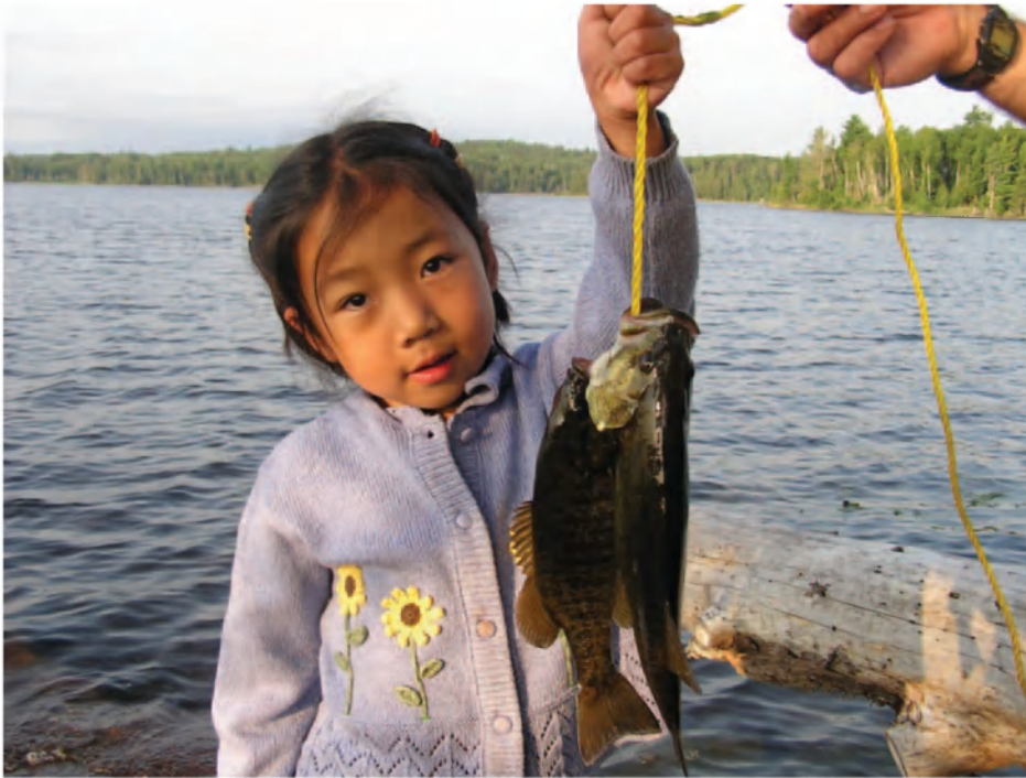
Figure 3. A young girl fishing in the Boundary Waters Canoe Area Wilderness within the Superior National Forest in northeastern Minnesota.

and shelter; healthy environment, water, and air; social cohesion; and freedom of choice to do what an individual values doing. These are values received broadly across society, not just to those driven to and capable of outdoor recreation participation.