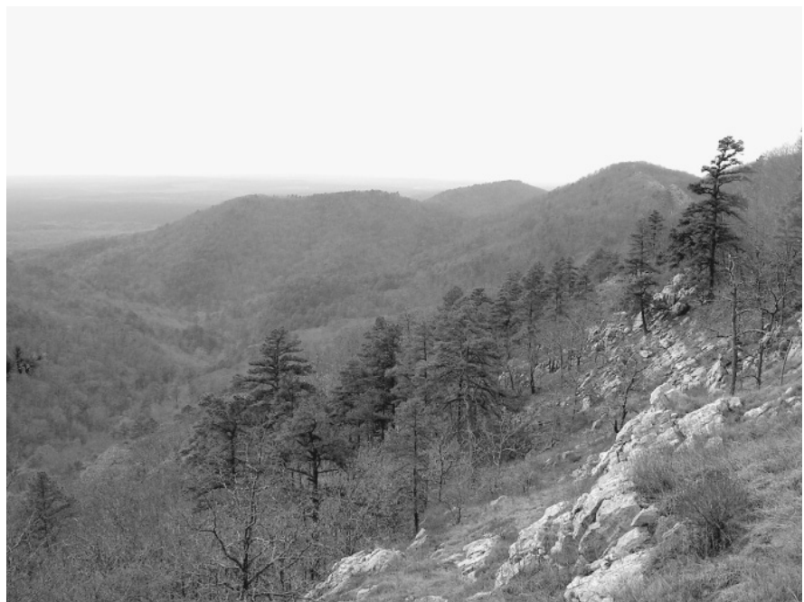
Figure 1—Overview of the Caney Creek Wilderness from the Tall Peak trail.

Caney Creek Wilderness covers 14,460 acres (5830 ha) of the Ouachita Mountains of west-central Arkansas (see figure 1). Vegetation is a dense cover of oak-hickory-pine forest. Topography is dominated by two parallel creeks, Caney Creek and Short Creek, separated by long ridges with local relief of more than 1,000 feet (300 m). Although there are about 20 miles (32 km) of trail in the wilderness, most use occurs along the 9-mile (14.4-km) trail that follows Caney Creek. Most of the Short Creek drainage is trailless, but not difficult to traverse. Use is quite heavy in the wilderness, estimated at more than 12,000 visitor days in the early 1990s.