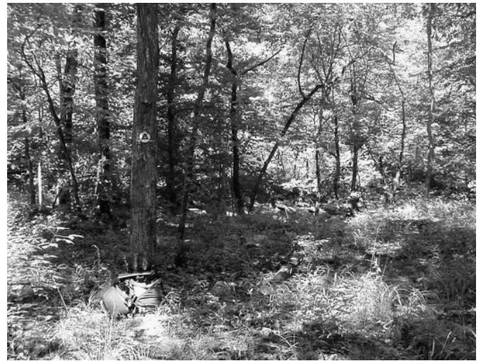
Figure 5—Highly impacted campsite (a) in 1993, one year before closure and (b) in 1999, five years after closure.

be even more effective in limiting campsite impact. Although that is possible, recent research at Grand Canyon National Park shows that new campsites are often created even in places with designated campsite policies (Cole et al. 2008). Moreover, a large proportion of the new campsites at Caney Creek were in trailless areas, where campsites are few and far between. Future success might be most dependent on the ability to persuade visitors to use established sites in popular places and to eliminate all trace of their camping activities when they visit trailless places. IJW