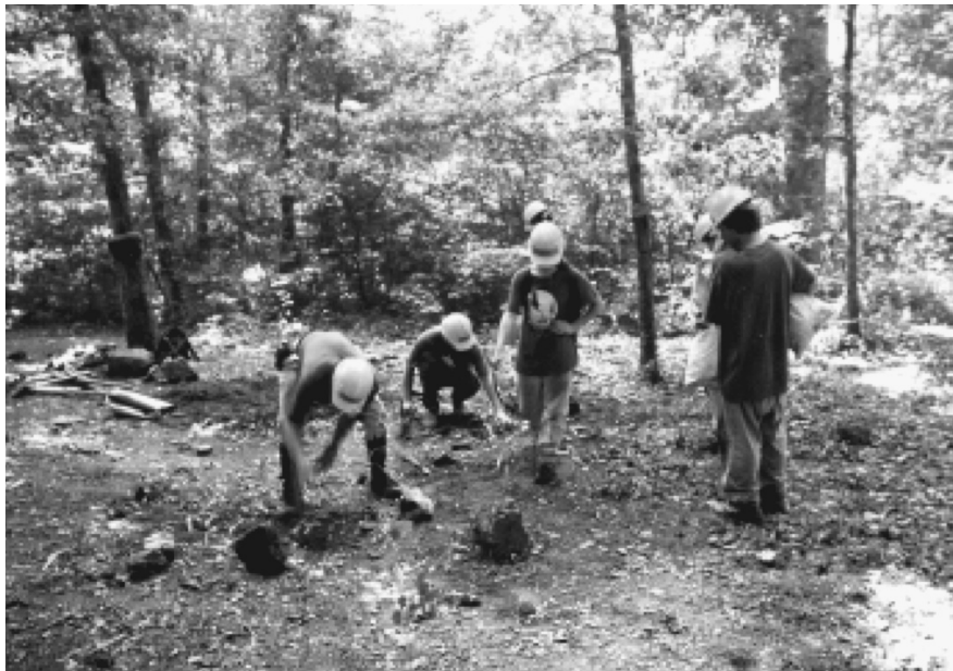
Figure 2—Student Conservation Association crew planting transplants among buried rocks on a closed campsite.

In addition, between 1994 and 1996, 16 well-established campsites were closed to use and restored. Soil was scarified and planted with seed and locally collected transplants. Large rocks were buried in tent pads to make the site less conducive to camping (see figure 2). Plantings were watered and mulched. Ribbon was tied between trees to cordon off the site, and a “No Camping” sign was posted. In addition, fire rings and fire remains were scattered at 26 lightly impacted sites.