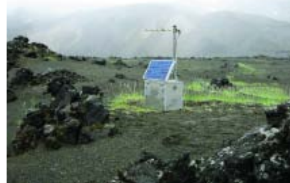
U.S. Geological Survey photograph

and therefore approved, or that they are harmful and therefore denied. A comprehensive evaluation framework that considers legislation, policy, and the benefits and impacts of the proposed work is needed most. This framework would stimulate dialogue between managers and scientists when the scientific activity is first being considered. Such dialogue offers the best chance for balancing scientific research on ecological systems and human relationships to these systems with preserving the wilderness character of Alaska wilderness.