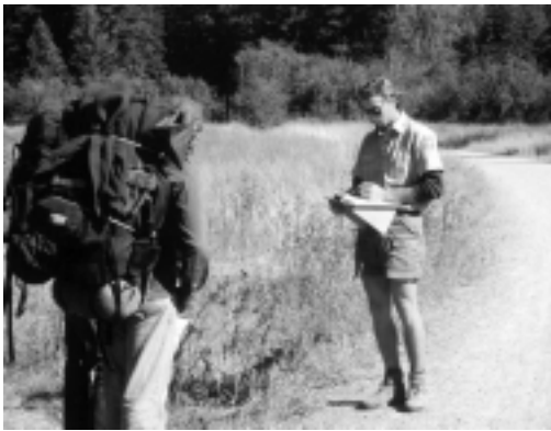
Figure 1—Debates over requiring permits to visit wilderness represent different relationships with wilderness.

is only a perceptual attribute. In reality, there was long-term intervention by indigenous people to increase their chances for survival, and perpetual intervention by more modern society to manipulate game populations, influence the role of fire in the ecosystem, and create travel corridors for human travel, even if by primitive means. Uncorrupted is also a perceptual attribute, related to the purpose of a human intervention on the land or water. If the human impact is done to support privatization or commercialization of nature at the expense of spiritual or intrinsic values associated with that wild place, it becomes corrupted. Distant urban populations would probably be uninterested in both trammeling and corruption, and more likely define wilderness character of a water catchment in terms of a lack of