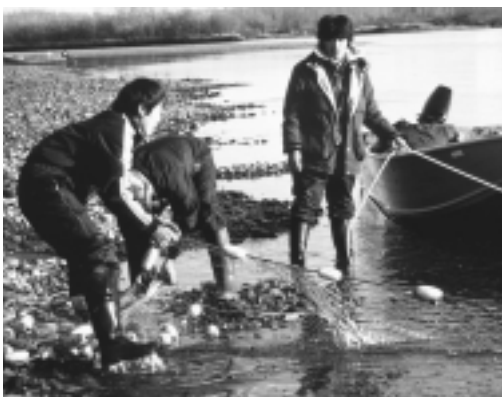
Figure 2—Inhabited wilderness implies a very different set of values from the ones described in the U.S. Wilderness Act.

is only a perceptual attribute. In reality, there was long-term intervention by indigenous people to increase their chances for survival, and perpetual intervention by more modern society to manipulate game populations, influence the role of fire in the ecosystem, and create travel corridors for human travel, even if by primitive means. Uncorrupted is also a perceptual attribute, related to the purpose of a human intervention on the land or water. If the human impact is done to support privatization or commercialization of nature at the expense of spiritual or intrinsic values associated with that wild place, it becomes corrupted. Distant urban populations would probably be uninterested in both trammeling and corruption, and more likely define wilderness character of a water catchment in terms of a lack of