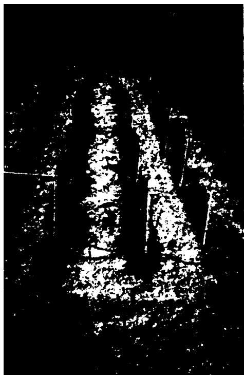
Fig. 1. The two trampling lanes immediately after 50 passes in tennis shoes (left) and 250 passes in lug-soled boots (right). Note horizontal bar for measuring vertical distances.