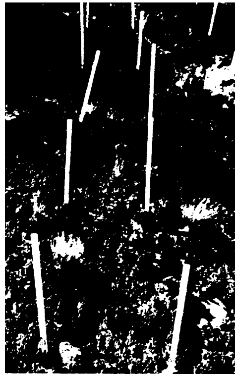
Fig. 3. The lane that received 250 passes in lug-soled boots after five years of recovery. View is from the end opposite that in Figure 1.

Substantial recovery occurred in the first